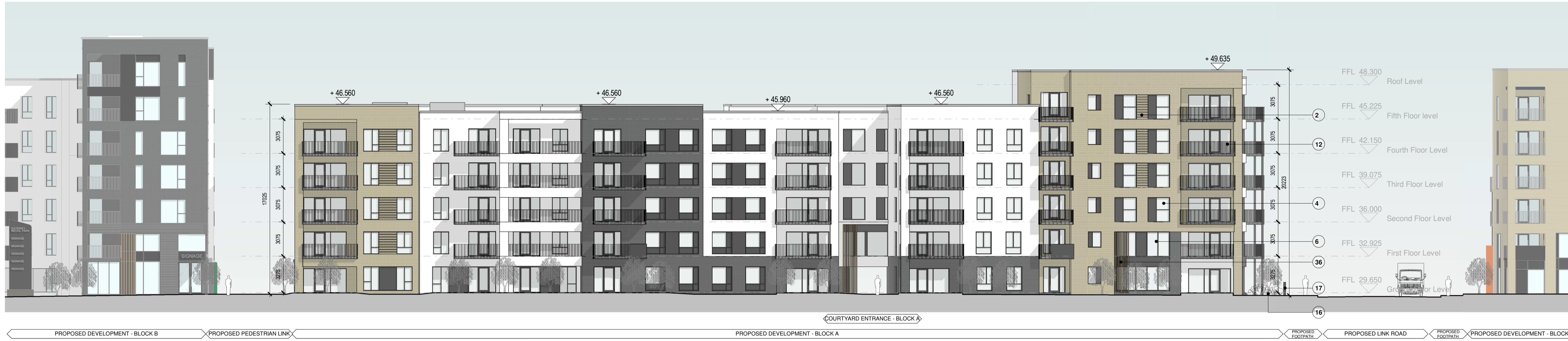
1 BLOCK - A - EAST FACADE ALONG WESTERN DISTRIBUTOR ROAD 1 : 200