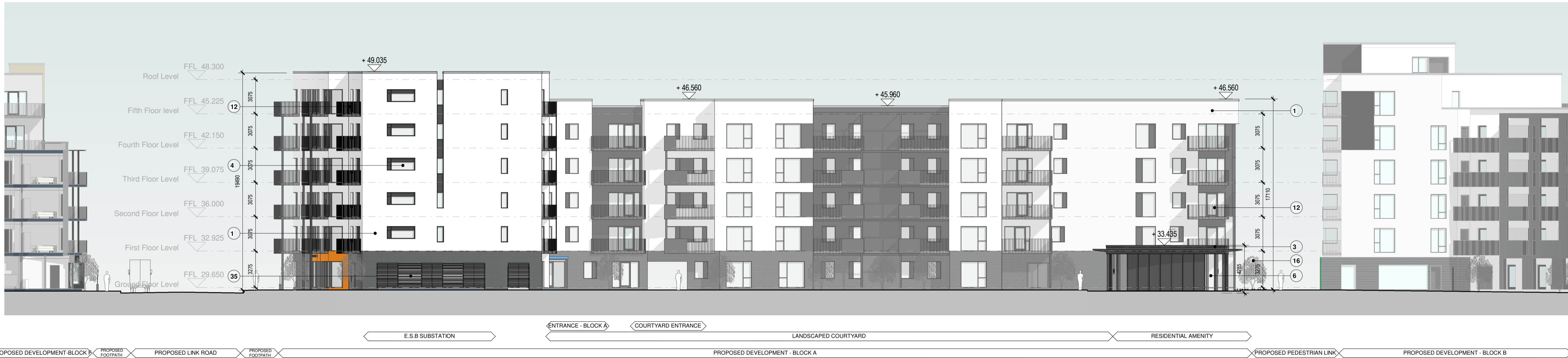
2 BLOCK A - WEST FACADE ALONG LANDSCAPED COURTYARD 1 : 200